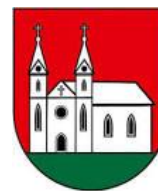
Krásnohorská Dlhá Lúka